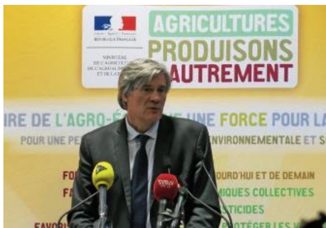
Figure 2: The former French Minister for Agriculture, Stéphane Le Foll, with the slogan “Agriculture – Producing differently” in the background