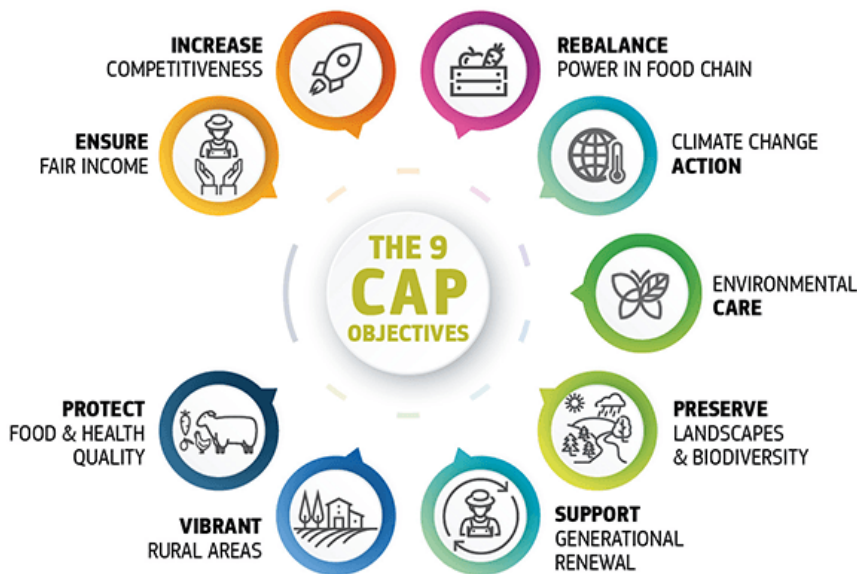
Figure 1: The nine objectives proposed for the CAP 2021-27