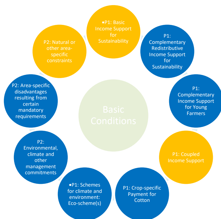
Figure 3: Key decoupled payment instruments proposed for the CAP 2021-27

Direct support has long been a flagship component of the CAP as a means of stabilising farm income. While historically direct aid have been linked to the production of specific commodities, since the 2003 CAP reform they have been gradually decoupled from production overtime. At the same time, the option to couple some payments for vulnerable sectors has continued to some extent. Overall, direct payments are not focussed specifically on environmental and climate action although they do require farmers to fulfil basic requirements and standards under cross compliance. As direct payments make up the bulk of the CAP's total spending they have continued to be scrutinised due to their lack of socio-economic and environmental targeting and as a result their imbalance distribution and potential risk to negatively affect sustainable land use and management choices. During the 2013 CAP reform this resulted in efforts to justify the need to maintain direct payments as a flagship tool through the introduction of a new system of mandatory and voluntary components under Pillar 1 e.g. basic payments with greening requirements, redistributive payments and capping of direct payments. Income support is also offered to farmers in areas with specific constraints currently through either Pillar 1 or 2. An overview of the payments addressed in this section are highlighted in orange in figure 3.