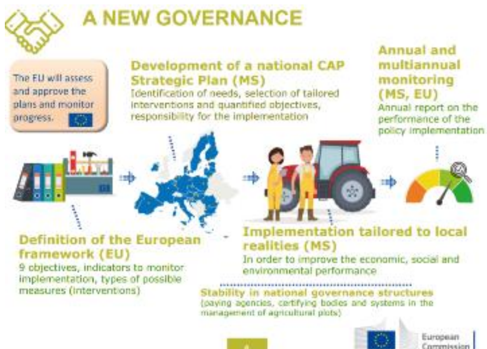
Figure 4: The proposed new governance model for the CAP 2021-27

The proposals for networking are in line with the move towards the common strategic approach planning setting out how all interventions can address the range of CAP objectives. It will therefore broaden from their current focus on rural development to consider the CAP as a whole, including Pillar 1 for the first time. CAP networks will have to be set up by each Member State (Art 113(1)), with a single EU-level CAP network 'European CAP network' (Article 113(2)) put in place to promote networking and knowledge exchange between the national networks as well as provide support, training and in-depth investigations into common issues.