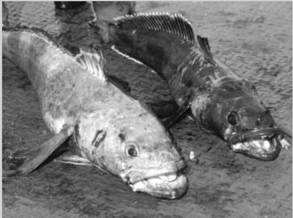
Half of the toothfish traded are caught illegally