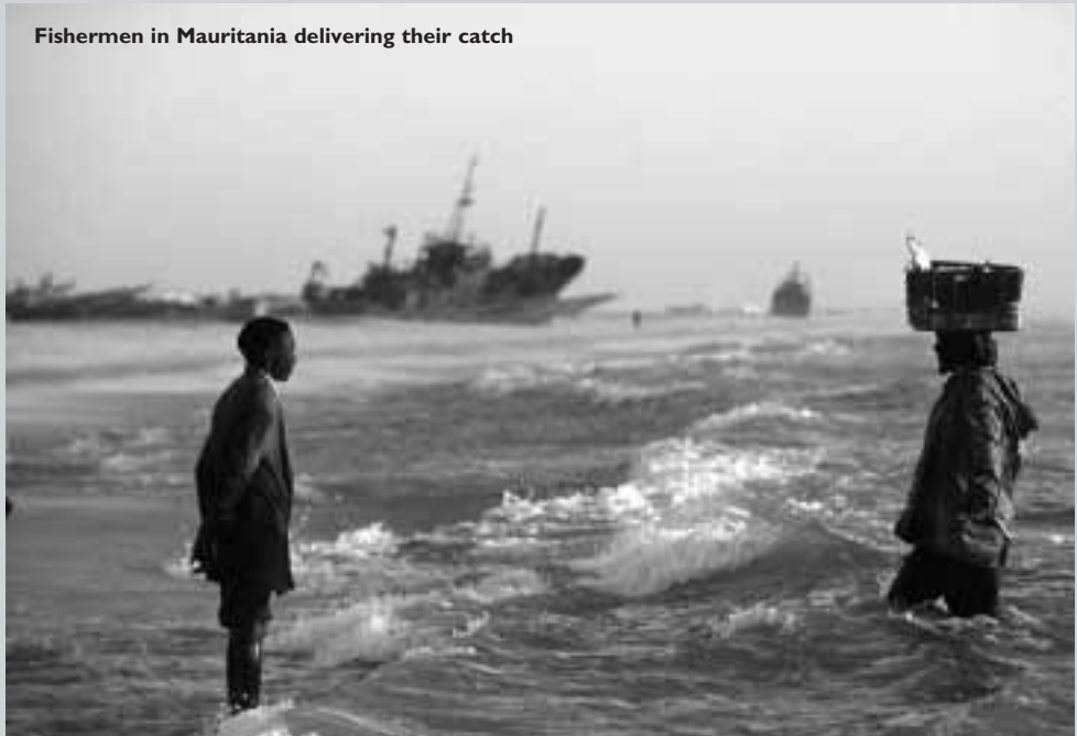
Fishermen in Mauritania delivering their catch

Communication and a Council Resolution on Fisheries and Poverty Reduction. It anticipates a new EU policy and strategy on distant-water fishing, as part of the Common Fisheries Policy reform process. These are important steps towards establishing a framework for fair and sustainable international fisheries arrangements.