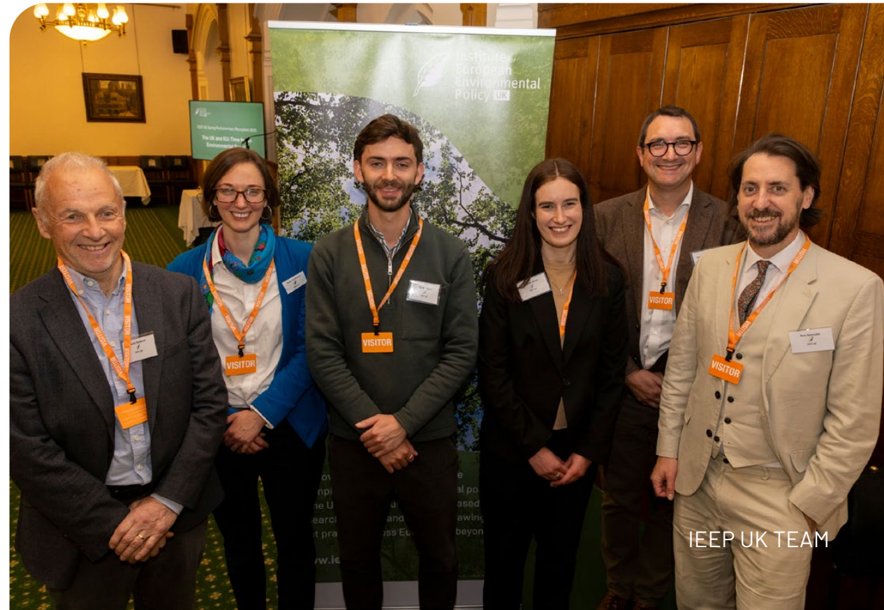
IEEP UK TEAM